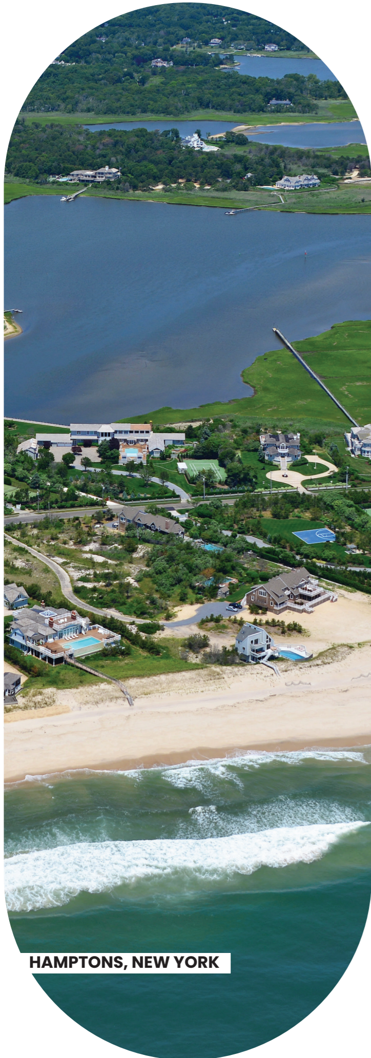
HAMPTONS, NEW YORK