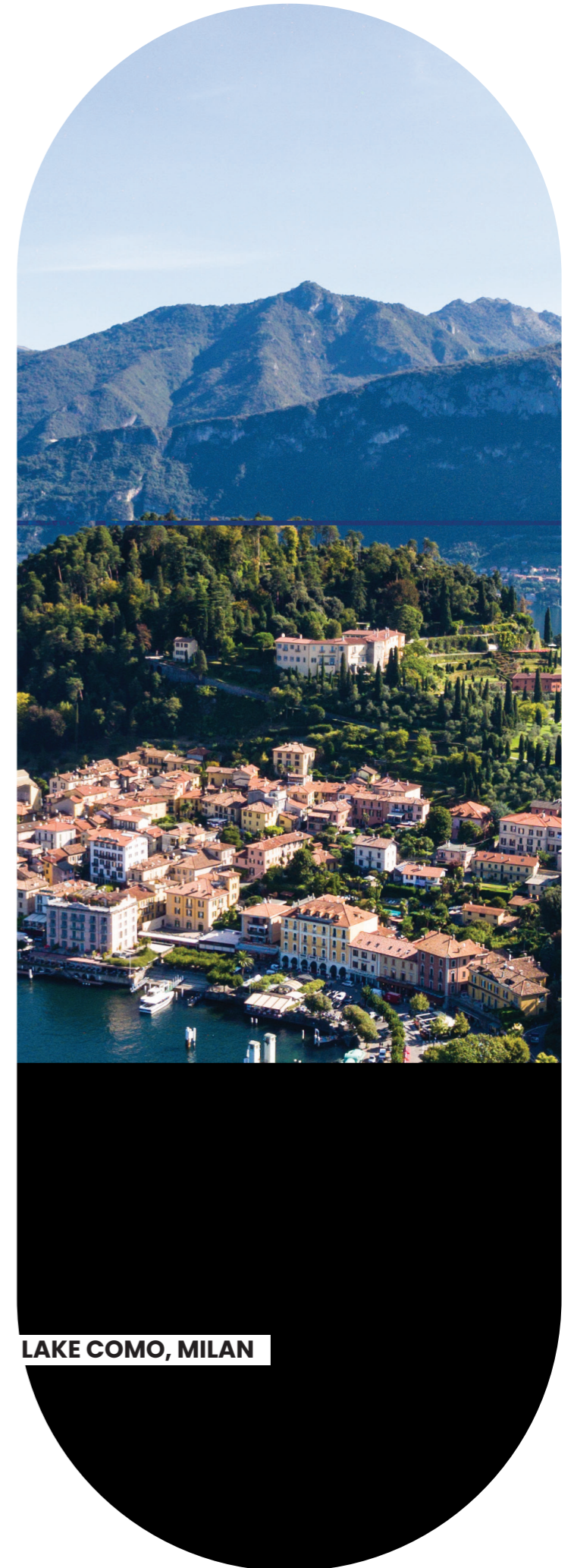
LAKE COMO, MILAN