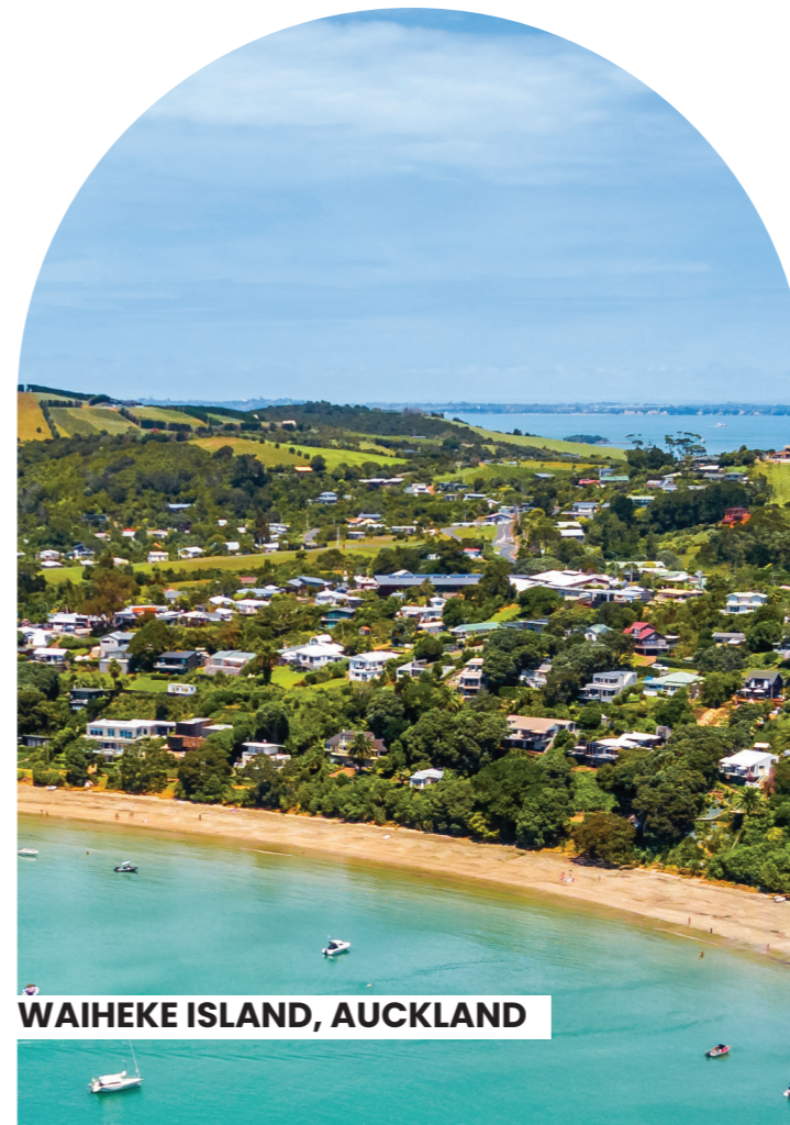
WAIHEKE ISLAND, AUCKLAND

That come with the perks of celebrity sightings, cozy getaways and solitudes that stay, you too deserve a world of your own, where you can mingle with the glitterati, and feel pleasure course through every bit of you.