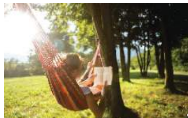
Stock Images used for representation purpose only