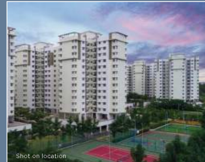
Shot on location