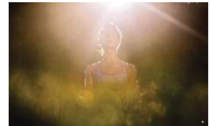
+ Stock Images used for representation purpose only