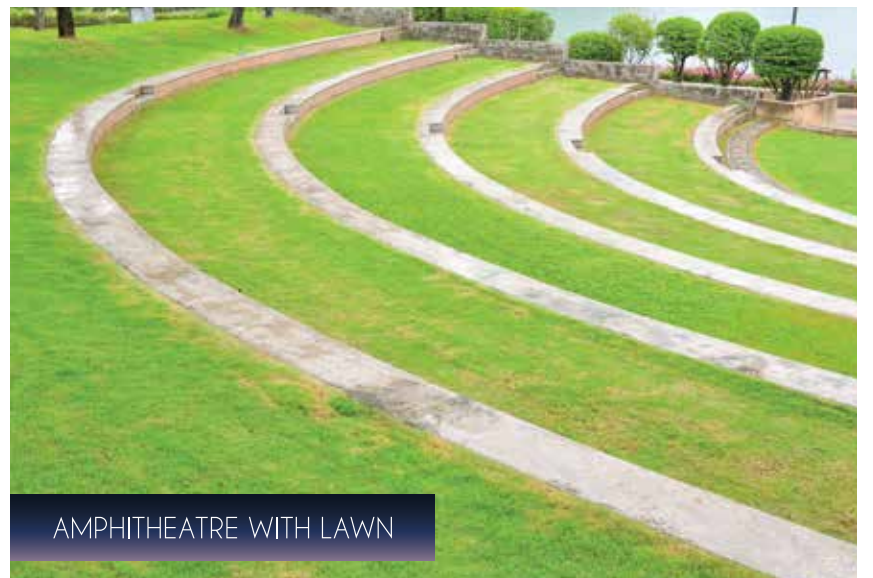
AMPHITHEATRE WITH LAWN