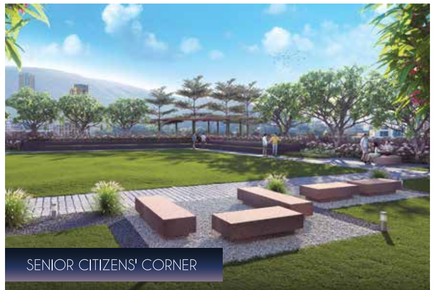
SENIOR CITIZENS' CORNER