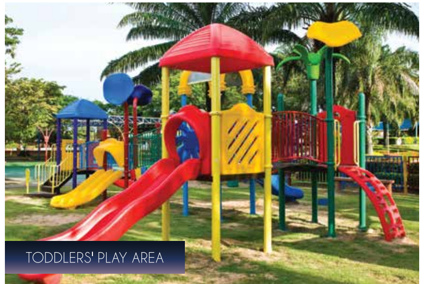
TODDLERS' PLAY AREA