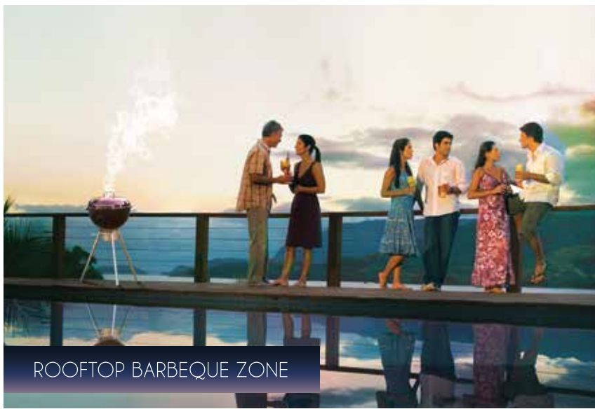
ROOFTOP BARBEQUE ZONE